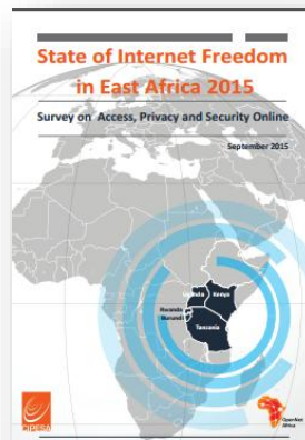
State of Internet Freedom in East Africa 2015